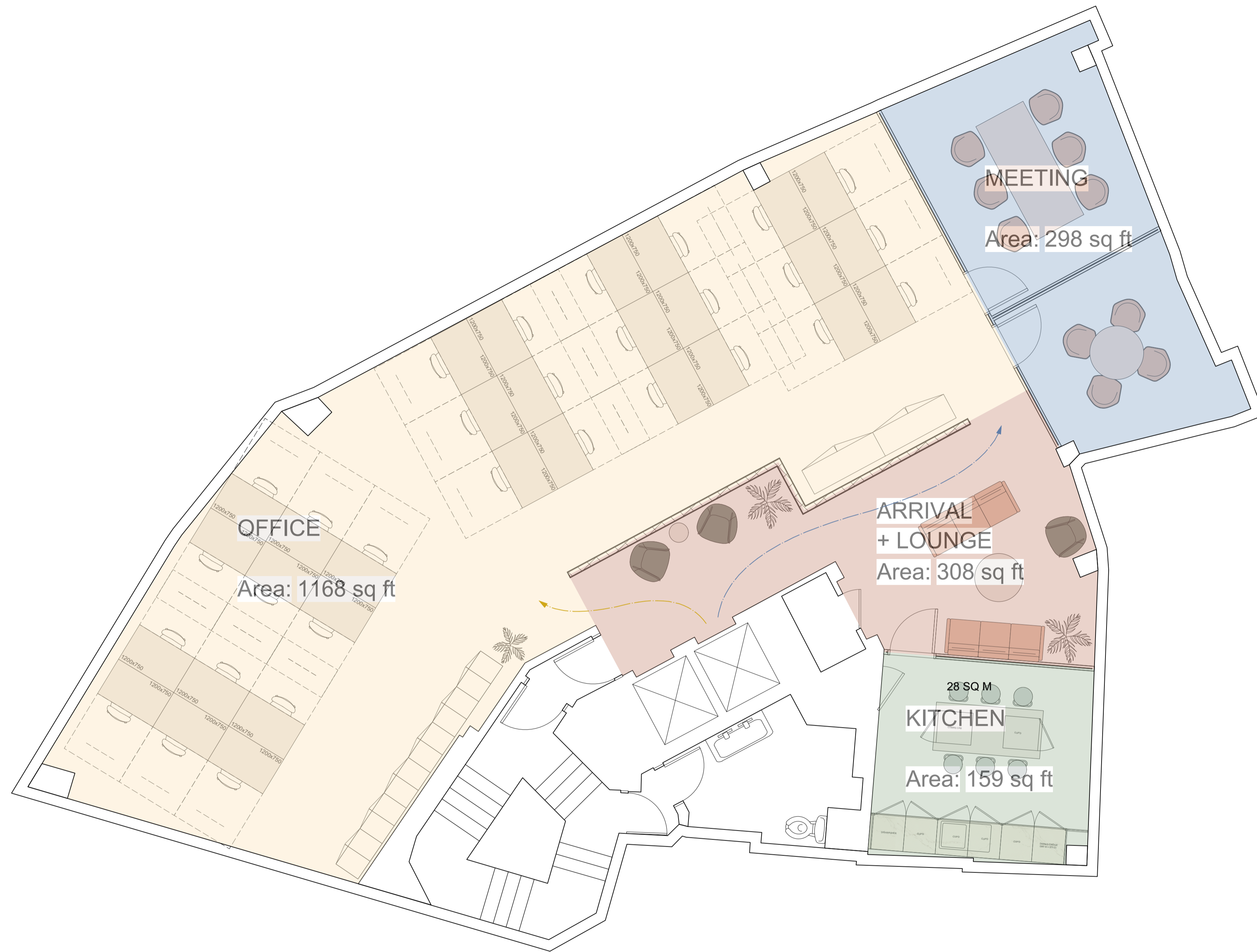
1 SECOND FLOOR GA PLAN Scale: 1:50